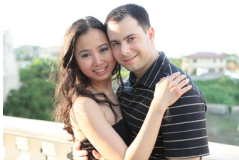
By Wally Gonzales at Fernbrook

The celebration will be held at a beautiful venue filled with style, romance, and grandiosity. Fernbrook Gardens is located near the village of Portofino South, close to Alabang Town Center and Ayala Alabang Village in the Philippines.